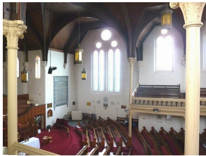
Original sloping floor and fixed pews