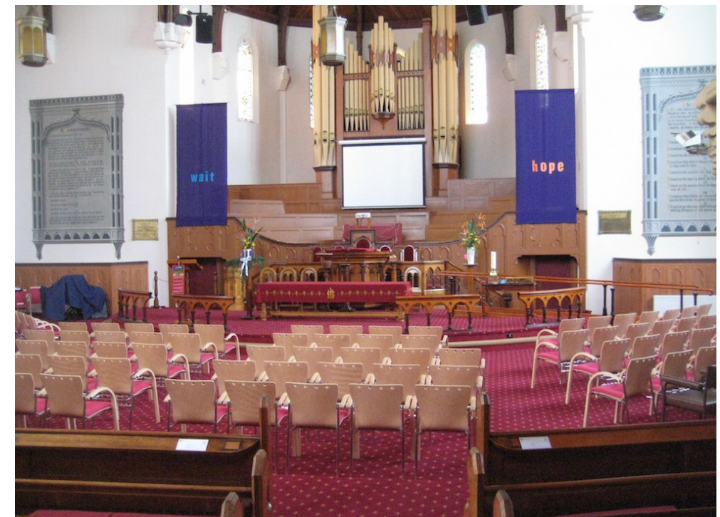
Levelled floor with movable seating and reconfigured paneling and platform