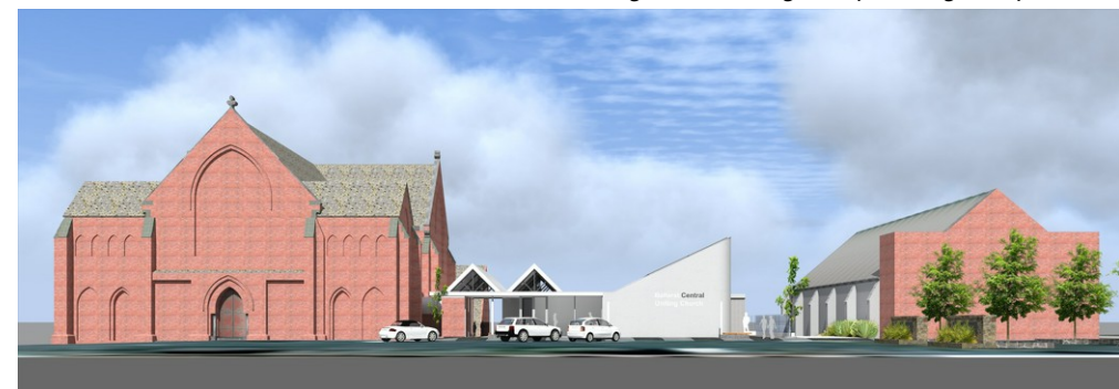
Concept for new Extension

Ballarat Uniting Church is located in the heart of the city alongside the university campus. This masterplan will establish a complex to serve the broad work of the church, students, community space and teaching. It includes: