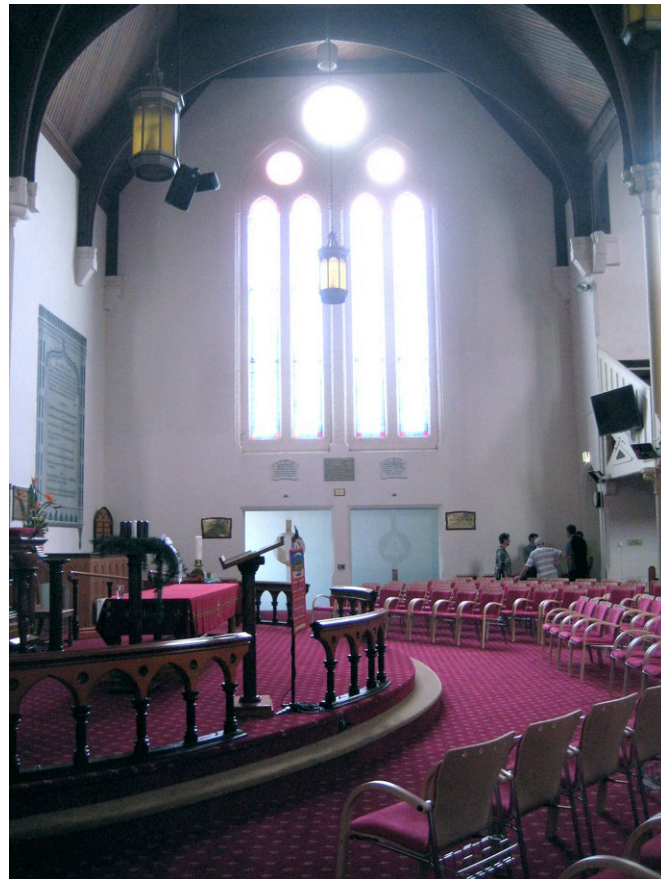
Levelled floor and new glazed doors