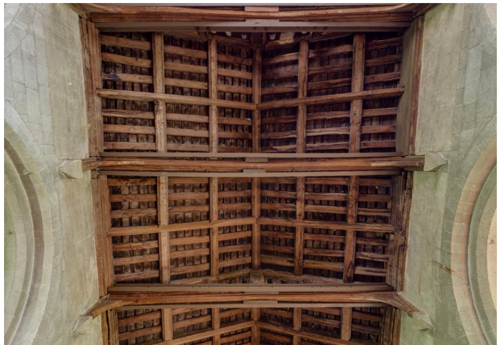
St Andrew's Shrivenham, strengthened roof structure.

Councils and government do this to plan and budget. In churches we often only respond when trouble appears. However, if we could forecast it and had nipped it in the bud, a "stitch in time would have saved nine". Currently the Anglican Diocese of Adelaide is starting to use the process.