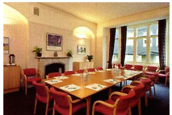
St Aldates Parish Centre boardroom adapted from a house

"Making Property Serve Mission - Rethinking the Church's Buildings for the 21stC" is now available in paperback and eBook