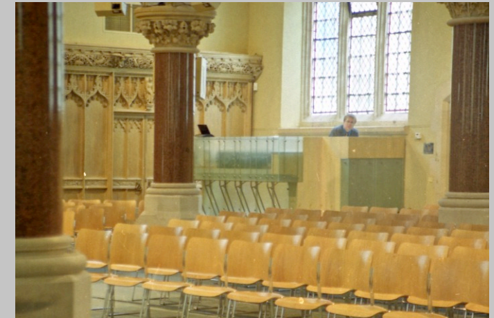
New sound desk in heritage church as piece of new furniture

All of this can maximise the value from heritage property in order to reinvest it in the mission of the church. As the church today and inheritors of these amazing buildings given to us by the church of the past, we owe it to them to maximise and use the value wisely for the future church.