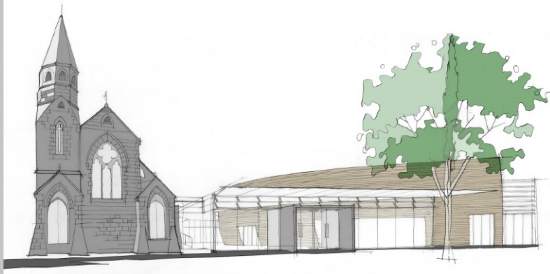
Heritage church in Werribee with scheme for new entry foyer and new multi-purpose larger auditorium to enable 2 congregations to meet.

Another way to arrest decline has been to regenerate the ministry, with new leadership or new members. Many currently well attended churches have been through low