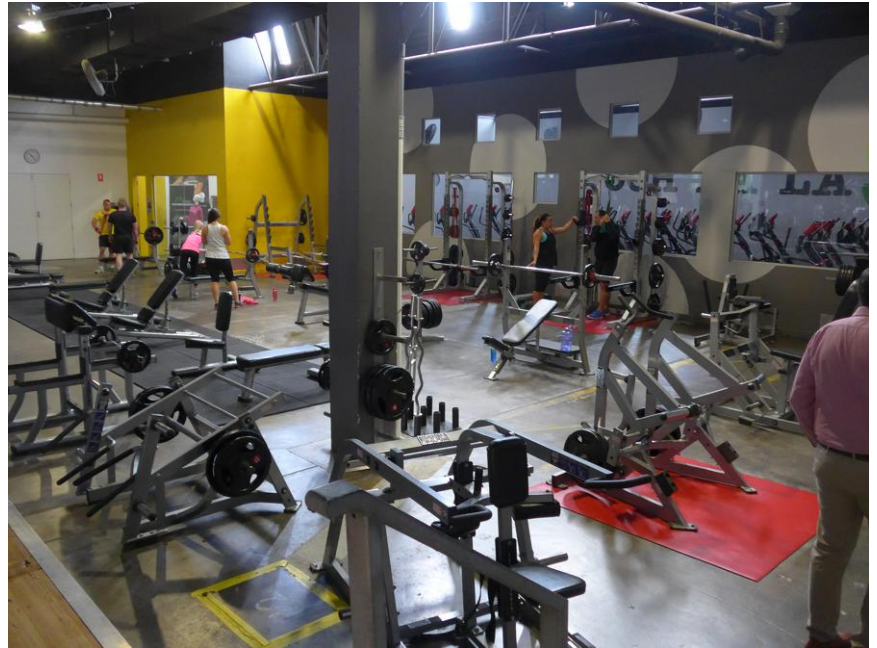
Door of Hope, Launceston's Gym

complex consciously constructed by the church training as a sports centre for the local community. It has a well-equipped gymnasium, a large sports hall and an indoor swimming pool, in addition to a cafe and a range of meeting rooms.